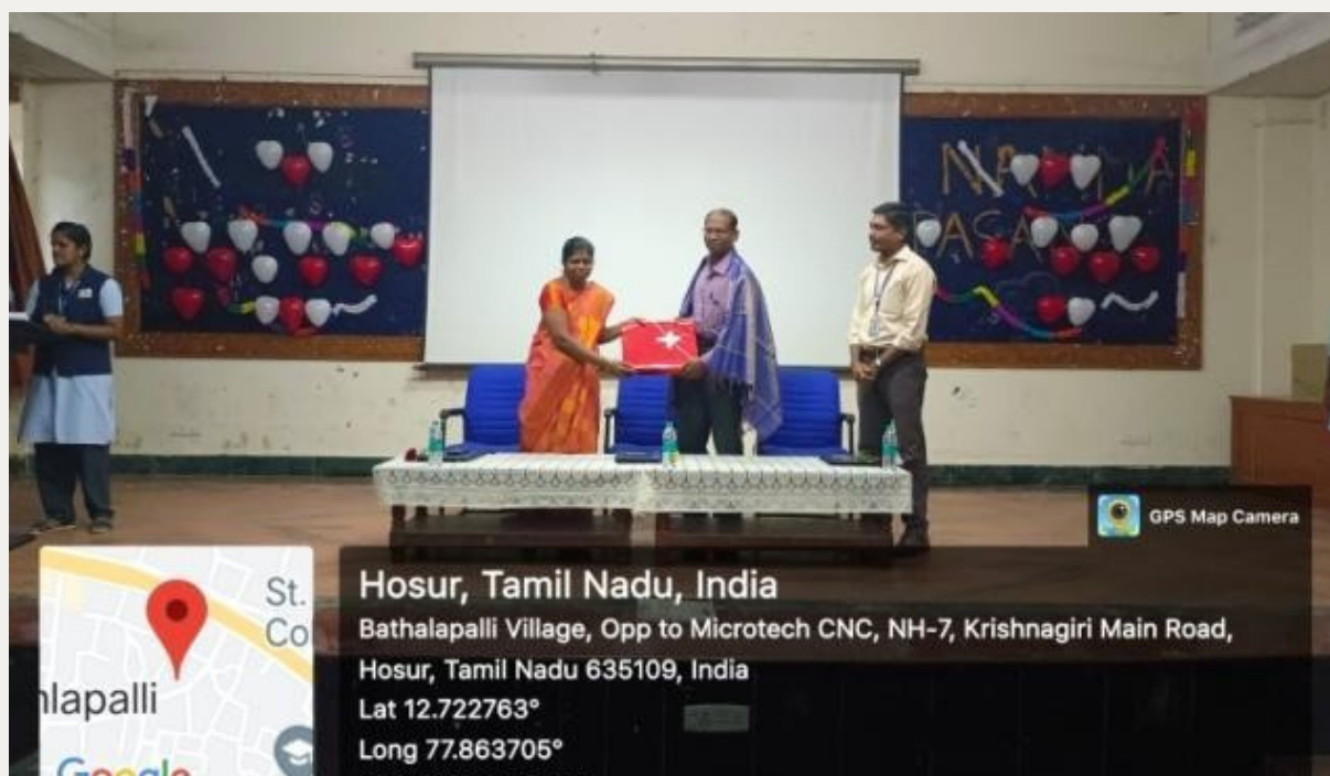
Honoring the chief guest