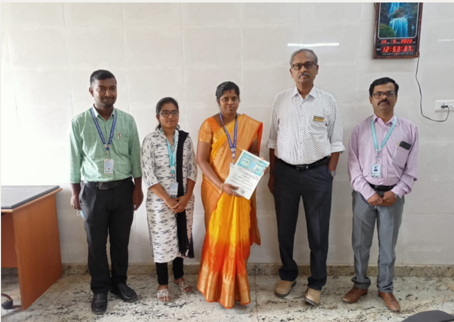
MoU with St. Peter's Medical College Hospital and Research Institute, Hosur