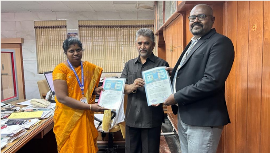
MoU with Atheenapandian Private Limited, Courtallam