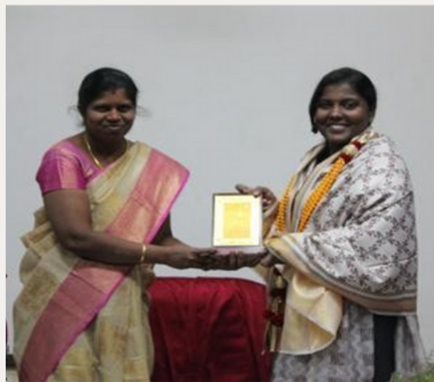
Honoring the chief guest